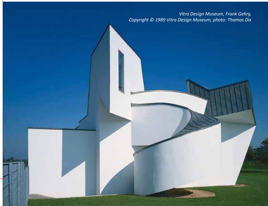
Vitra Design Museum, Frank Gehry, Copyright © 1989 Vitra Design Museum, photo: Thomas Dix