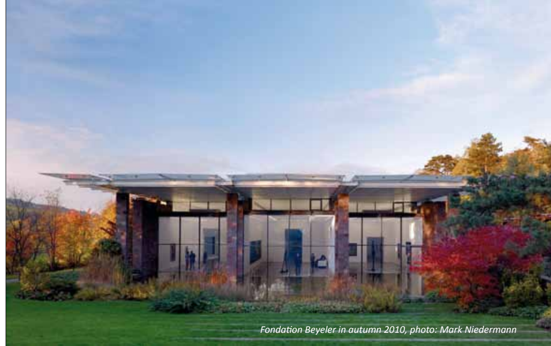
Fondation Beyeler in autumn 2010