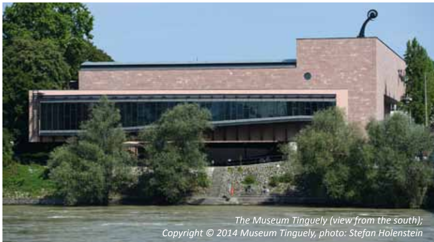
The Museum Tinguely (view from the south); Copyright © 2014 Museum Tinguely, photo: Stefan Holenstein